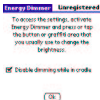
Figure: Configuration Panel

The configuration panel offers settings that apply to the general behaviour of all profiles or rather to some special circumstances. One of the settings here allows you to define whether you want to use the dimming feature while the device is positioned in a (charging) cradle.