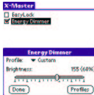
Figure: Dimmer's main dialog

To access the main dialog, Energy Dimmer has to be active. Open the main dialog by keeping your power button pressed for a couple of seconds or by tapping on the brightness icon in your graffiti area – just like you would normally do when trying to change the screen's brightness. Instead of the brightness adjust dialog as you know it, a new dialog will pop up.